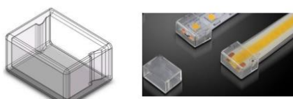
12mm waterproof End cap