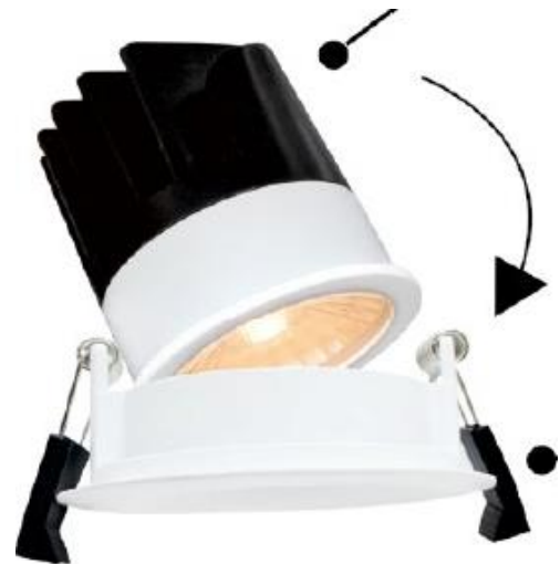
One module, different mounting rings